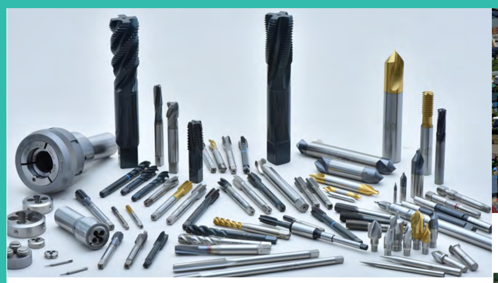
YAMAWA's motto is "Reliable Screw Threads". We enrich the manufacturing industry by producing the highest quality taps. In addition to taps, we also manufacture threading dies, drills, countersinks, combined drill countersinks and a broad range of other centering type cutting tools. Since YAMAWA's founding in 1923, we have been putting a continuous effort into quality improvements and technical progress as a general cutting tool manufacturer for over 90 years.